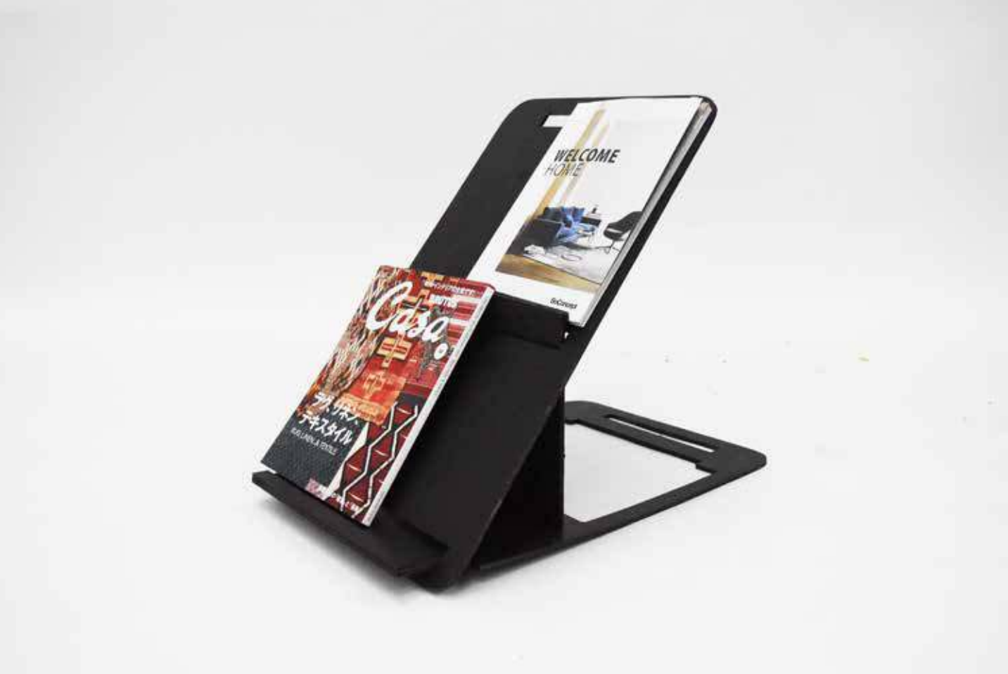
Magazine rack made from a sheet BRICK RACK