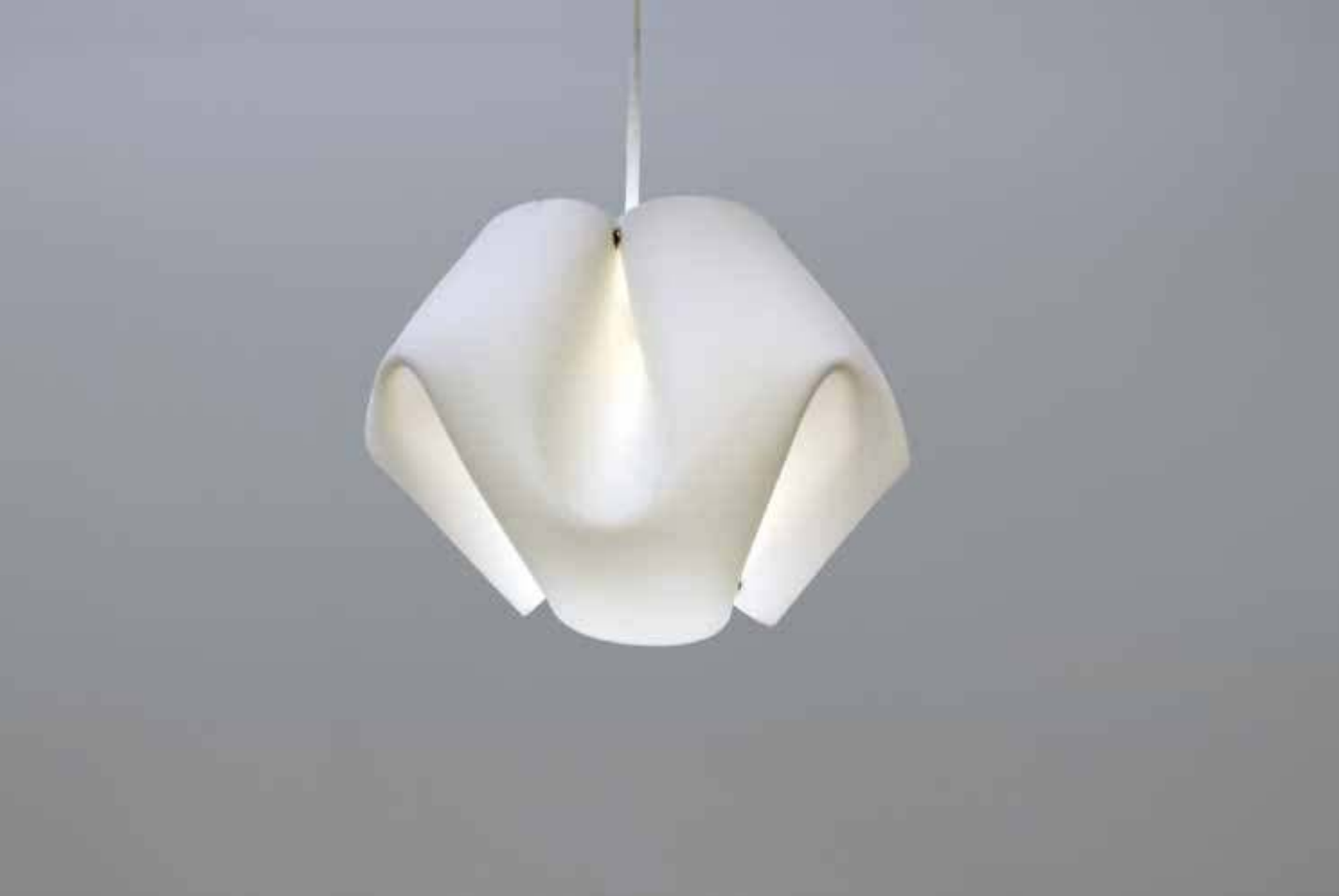
Lighting made from a sheet JELLYFISH LIGHT